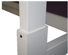
XR10 Winder leg