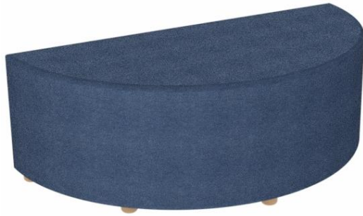
Code: CO-41 – 1200 L x 600 D