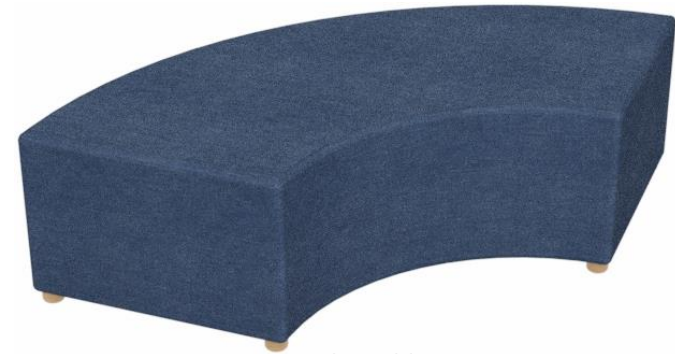
Code: CO-51 – 1150 W x 1150 D