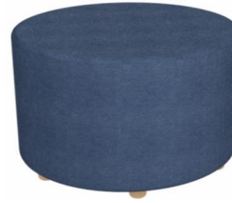
Code: CO-21 – 670 Dia