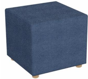
Code: CO-31 – 450 L x 450 D