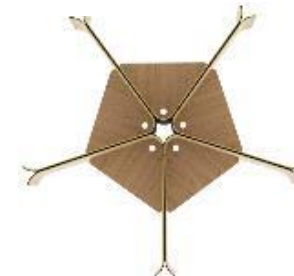
Cluster – 2980 L x 1904 D