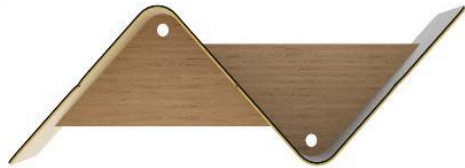
Wave – 3024 L x 935 D