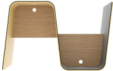
Dock – 2200 L x 1355 D