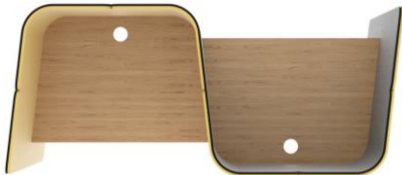
Nest – 2022 L x 858 D