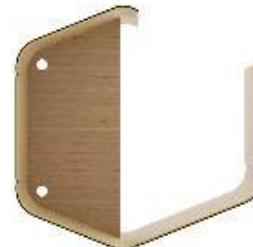
Bubble – 1738 L x 1717 D