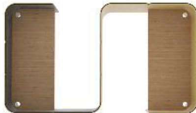
Helix – 2930 L x 1700 D