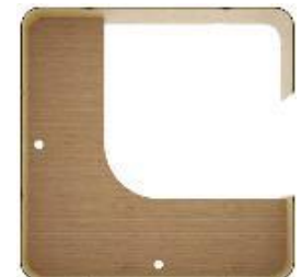
Nucleus – 2400 L x 2400 D

Other configurations can be made to order