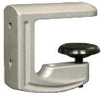
Clamp On Bracket