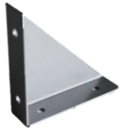
Bolt On Bracket