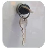
Standard Key Provision